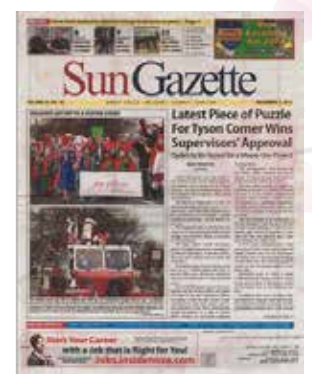
Joy of Dance students featured in McLean Connection Newspaper and Sun Gazette Newspaper marching in their Frosty Follies costumes on Dec. 4th, 2013.